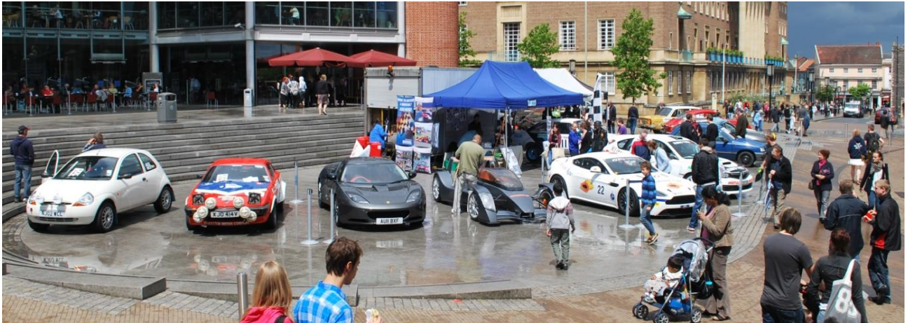
The SCCON display outside the Forum in Norwich on Saturday 18th June 2011