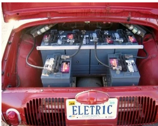
Rear-mounted batteries of a 1960 model

That's not an electric car, surely it's a French Renault Dauphine, but look closely and the air intakes behind the rear doors for the Dauphine's rear-mounted engine have been blocked off. In 1959 the Henney Motor Company of Illinois, set up a factory at Canastota, New York, to make electric cars. They chose the Renault Dauphine as the basis for their car because at 650kg it was the lightest car for its size. Henney built the body/chassis units using tooling and parts bought from Renault. The power-train was developed jointly with the California Institute of Technology (also known as Caltech). It consisted of a rear-mounted 7hp electric motor driving the rear wheels, with power supplied from two 18-volt battery packs wired in series to produce 36-volts. These were mounted in both front and rear compartments so the car had no conventional boot. Instead, the rear seats were optional and the rear passenger compartment could be carpeted to provide a luggage area that could be accessed via either of the rear doors. Those first cars weighed 907kg, had a top speed of around 40mph and a range of only 40 miles which wasn't practical, even in 1959.