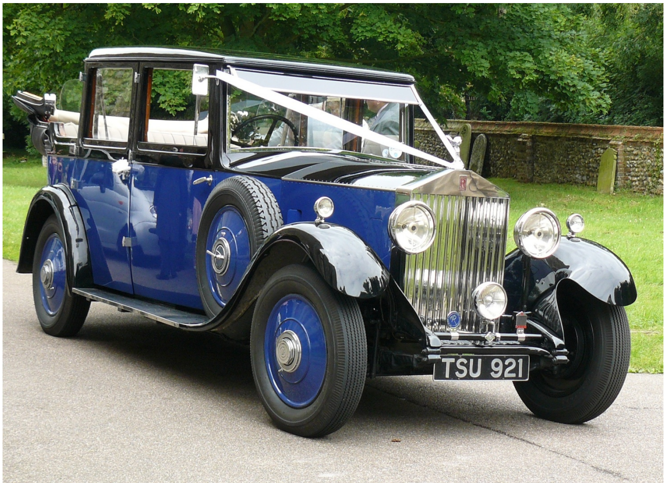
Dennis Ward's immaculate 1932 Rolls-Royce 20/25 Landaulette as frequently seen in its wedding livery