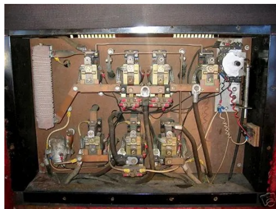
One of the Henney Kilowatt's circuit boards

So for the 1960 model year, the power-train was changed to a 72-volt system using twelve 6-volt battery packs. The car's weight increased to 968kg but the top speed of 60mph and the range of up to 60 miles were much better. 100 kits of parts were procured of which 47 were built into complete cars. About six are thought to survive. And how's this for a co-incidence: when I re-joined Lotus in 1996, one of my first jobs was to write a Lotus Engineering proposal to Calspan! It was for Lotus to design 'Active' control systems so that bundles of cars could drive very close together under computer-control on American Freeways. These nose-to-tail platoon-formations would increase the traffic capacity of their roads. The project was cancelled when Calspan lost their funding from the US Government, so Lotus didn't get the job.